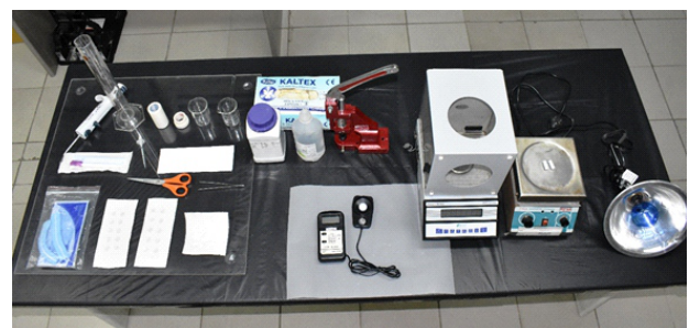
Materials/Equipment for Standardization Plan and Scoring

For more information contact info@cliantha.com