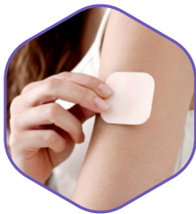
Transdermal Delivery System (TDS Patch)